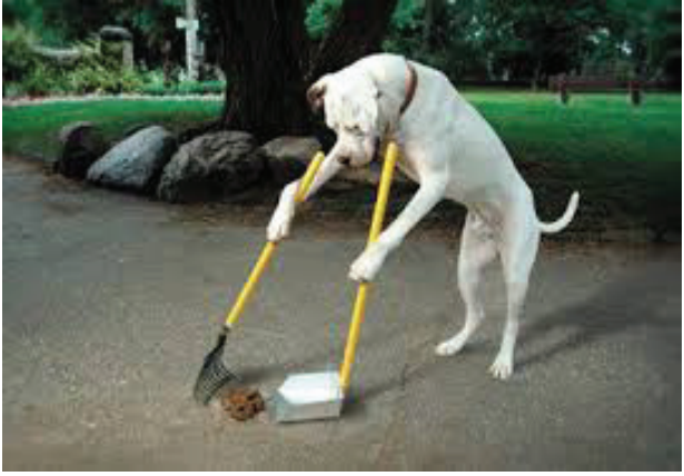
Continued on page 4

One more reminder – October is the beginning of "Deer Rutting Season" – PLEASE SLOW DOWN AND BE ALERT!